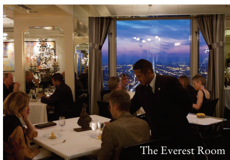
The Everest Room

What's your New Year's resolution? To lose weight, but I never stick to it. Most of the time I gain weight! What do you think will be the hot new restaurant of 2008? I think restaurants are going to go on the green side. I think it will definitely attract a lot of attention. What are three things you appreciate most when eating out? 1. Quietness. 2. Good execution of product. 3. Efficient